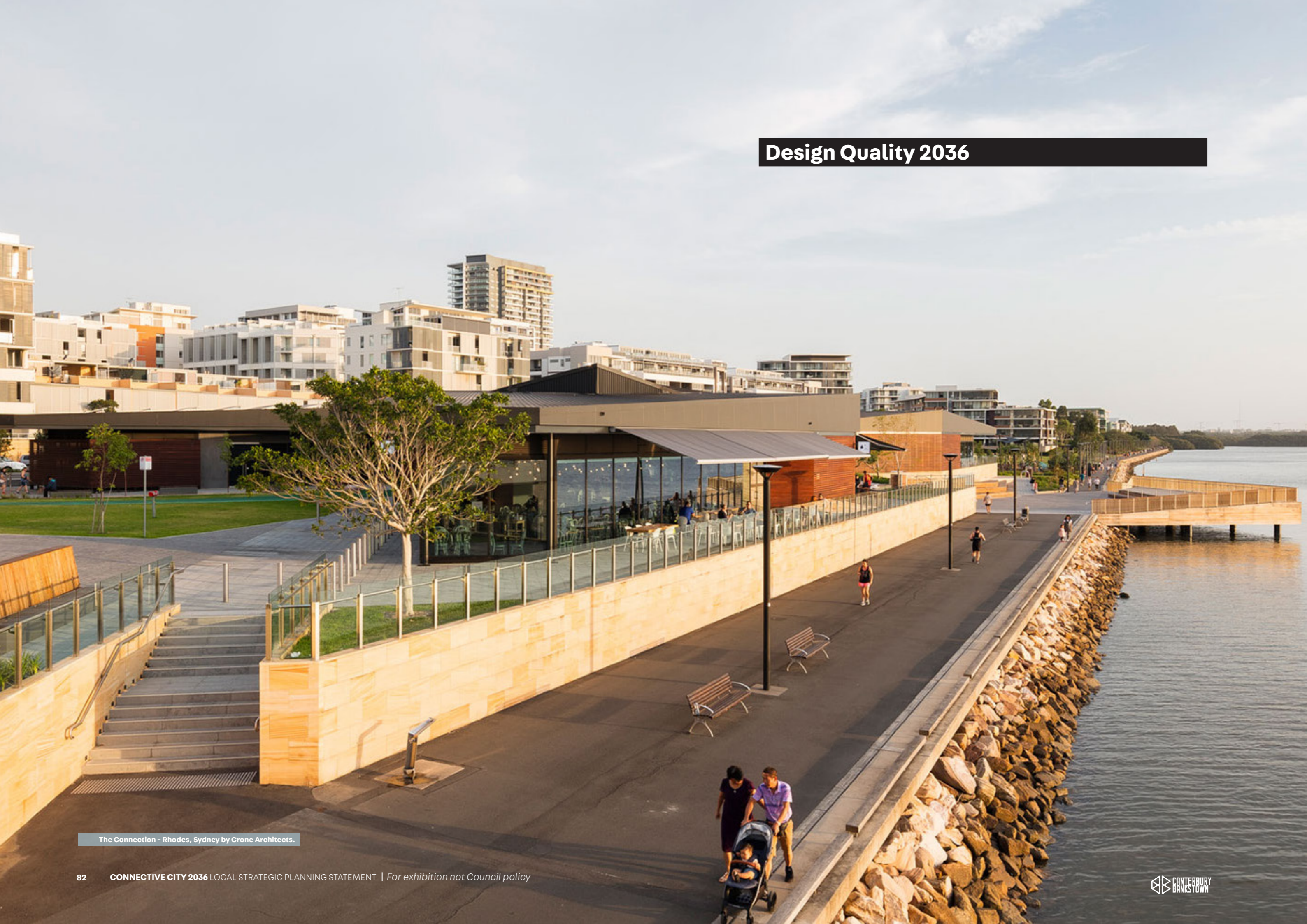
The Connection - Rhodes, Sydney by Crone Architects.