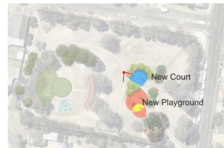
Viewing point location