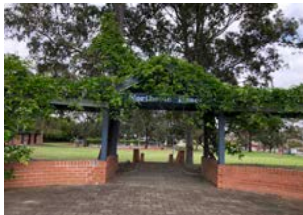
1 Park Entrance