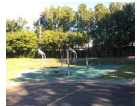
4 Outdoor Gym