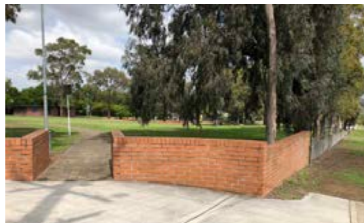
2 Park Corner Entrance