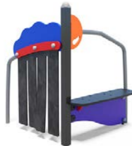
Capital Mini play house