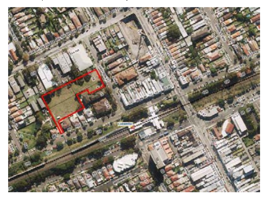
The aerial photo below shows the site in its Local Context:

The aerial photo below shows the subject site and current land use: