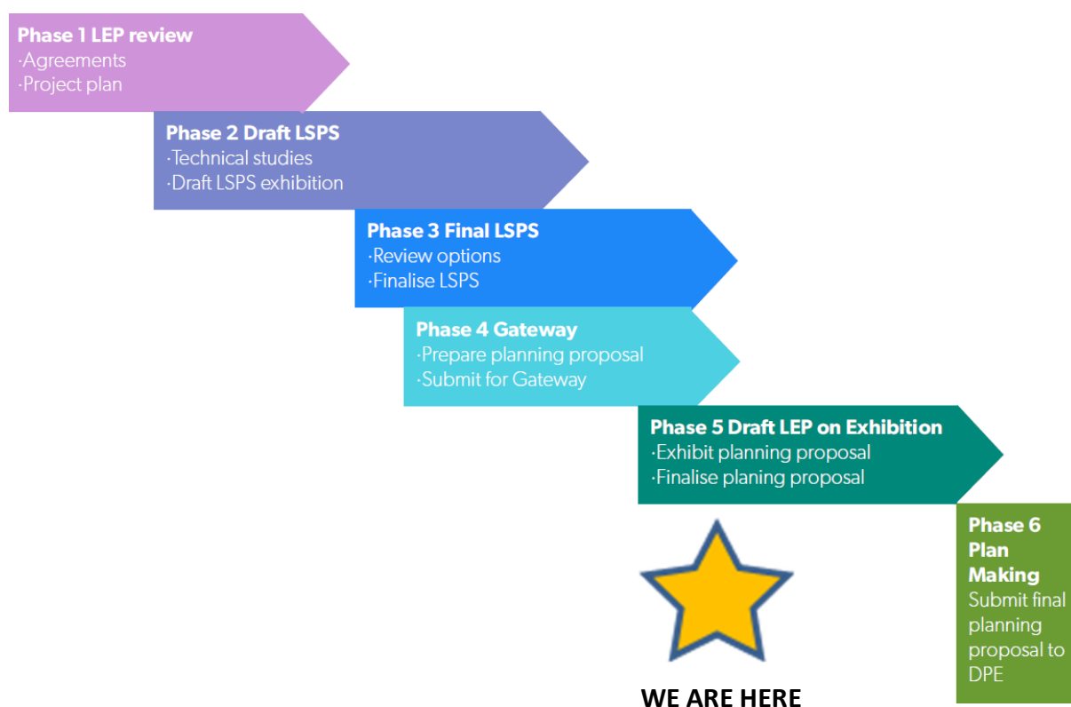
Figure 2: Accelerated Local Environmental Plan Program (key outcomes to be achieved)

In September 2018, Council endorsed the Project Plan to commence the Accelerated Local Environmental Plan Program as shown in Figure 2. The Project Plan requires Council to exhibit and submit a Consolidated Local Environment Plan to the Department of Planning, Industry & Environment for approval by July 2020.