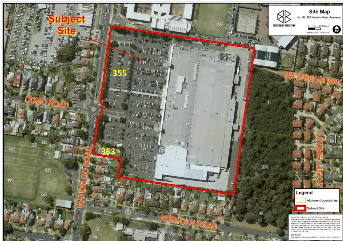
Figure 2: Aerial Image