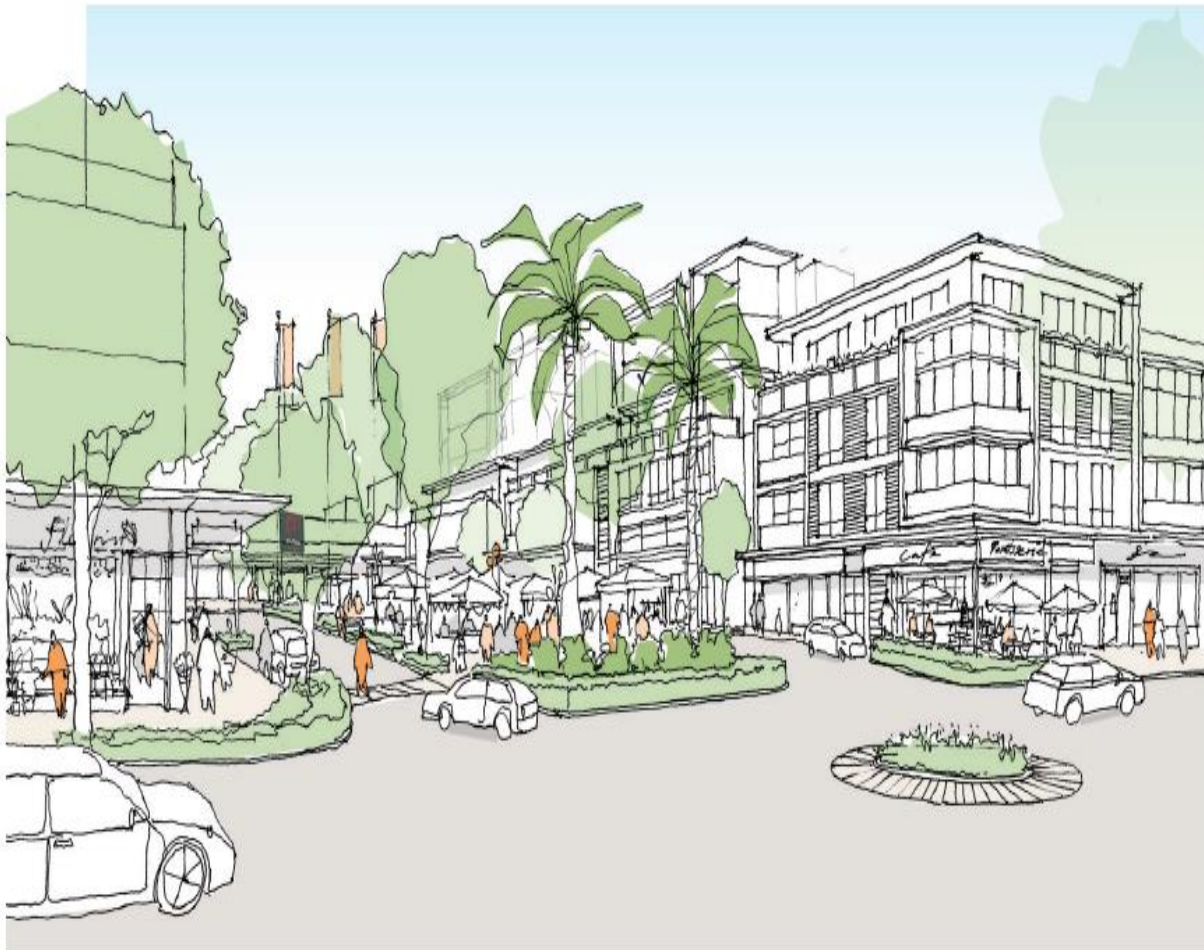
Figure 4: Application's indicative concept plan showing the new central piazza from Waterloo Road