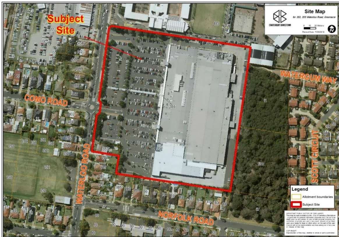
Figure 1: Site Map