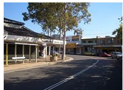
Panania's shops and post office

The East Hills railway line, which originally terminated one stop away at East Hills divided the suburb into two distinct precincts. During the 1980s, the railway line was extended with a rail bridge over the Georges River, to Campbelltown.