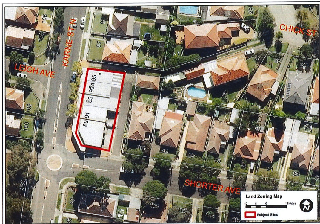
Map 1: Location (subject site shown edged in red)